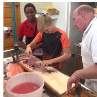
“Sally's ” Fish Market

Please consider patronizing the businesses and churches that help us. We could never repay them for their support.